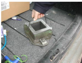
Handling cube moulds