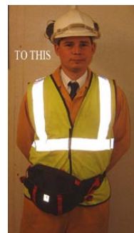
Personal protective equipment pouch - to this