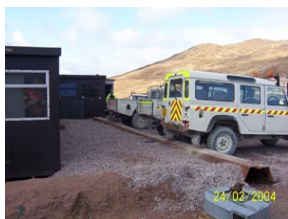
Design criteria for all haul roads