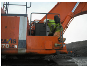
Greasing point before improvement