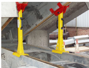
Tipper body props