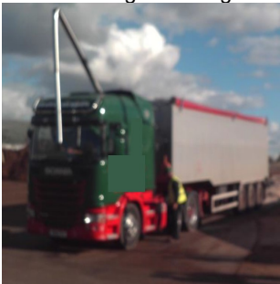
Final Ram Position