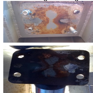
Trailer Tipper Ram Mountings