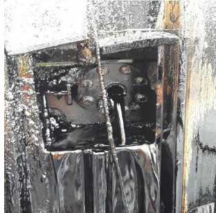
Butterfly Valve with Sensor Probe removed