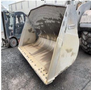
Before - Bucket showing razor sharp edge