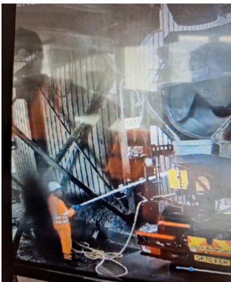
Image 1 - Driver standing outside exclusion zone washing his truck down

During the loading of a mixer truck the lump became loose, falling to the ground. The lump fell and landed inside an exclusion zone, however as the lump struck the ground, it broke into several large pieces, with some travelling outside the exclusion zone. Moments before the lump fell a driver had been standing outside the exclusion zone, adjacent to where the lump fell. Although the lump would not have hit him directly, there was potential for the broken pieces to have struck him on the back of the legs.