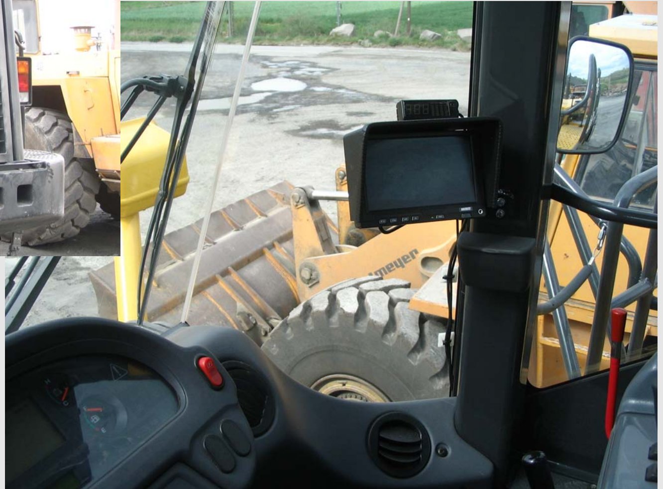
Loader with rearview-camera