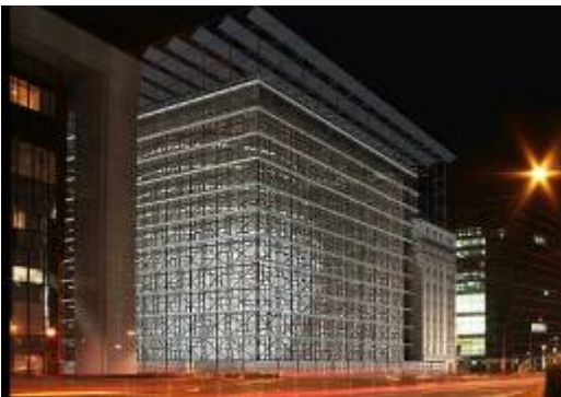
Council of the European Union