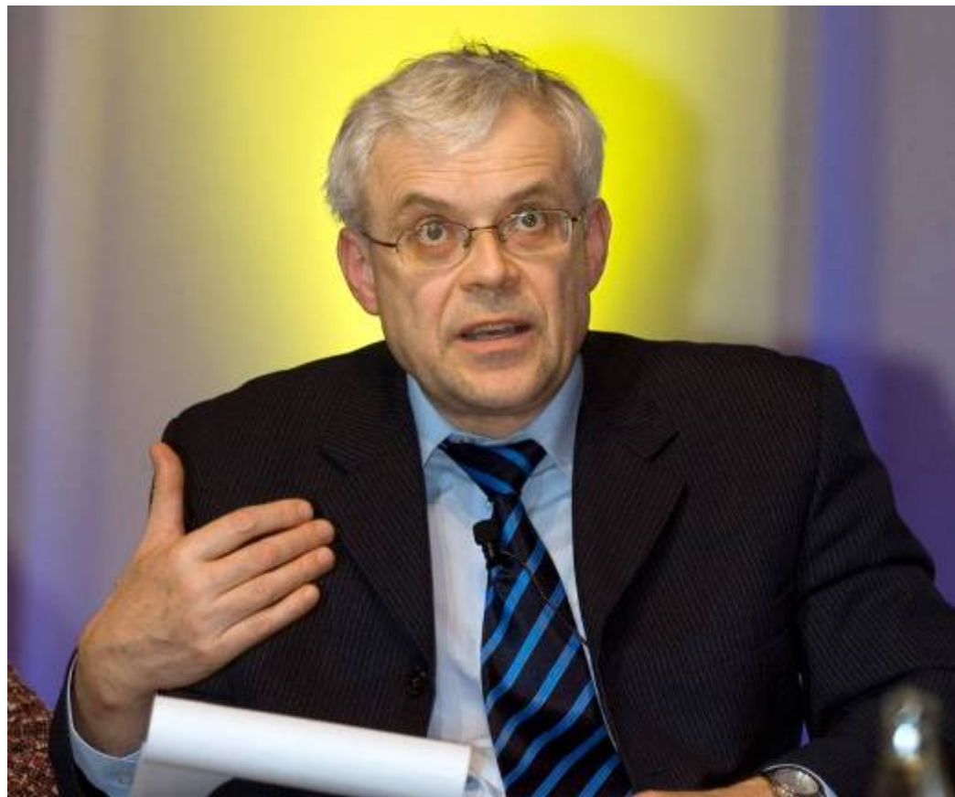
Commissioner Vladimir Spidla