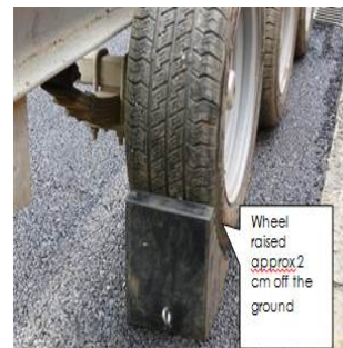
Chock placed under nearside wheel