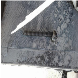
Bar used to by-pass system

During an inspection by the HSE at a block plant, a spare interlock bar was found under the block operator's seat. The spare bar could have allowed the release of the key with the gate still in the open position, this could then be used to restart the plant. This would have bypassed the interlock system that was there to protect workers.