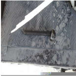
Bar used to by-pass system

During an inspection by the HSE at a block plant, a spare interlock bar was found under the block operator's seat. The spare bar could have allowed the release of the key with the gate still in the open position, this could then be used to restart the plant. This would have bypassed the interlock system that was there to protect workers.