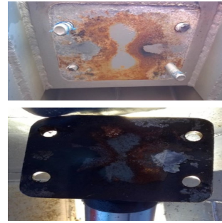
Trailer Tipper Ram Mountings