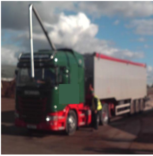
Final Ram Position