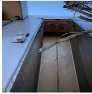
Top of Tipper Ram Mounting Plate