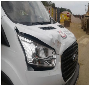
Collect Customer Van

- The FEL operative failed to adequately check for dangers whilst reversing.