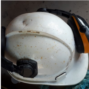
Hard hat with dent along back near centre

This design may exist on conveyor systems on other sites.