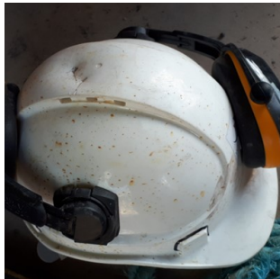
Hard hat with dent along back near centre

This design may exist on conveyor systems on other sites.