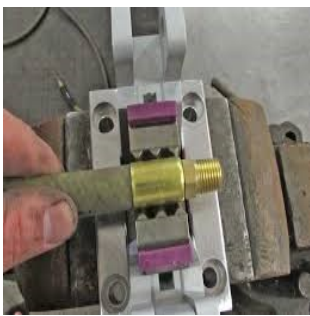
Mechanical cramped fitting

Review all airlines for suitability of use and type of fastener to secure the fitting. • Ensure the hoses used are made to British Standard for the application you are using. • Ensure the fitting is the correct size for the hose being used. • When adjusting any airline fitting, use a fresh, clean and undamaged part of the correct hose when fastening the fitting. • Use the appropriate fastener for your pressure applications. Seek advice from a hose specialist. • High pressure applications should use mechanical fabricated fitted or crimped fastenings. • The preferred mechanical fastenings shown below can be done in house with the correct equipment and training.