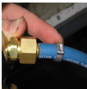
Crimped ring fitting