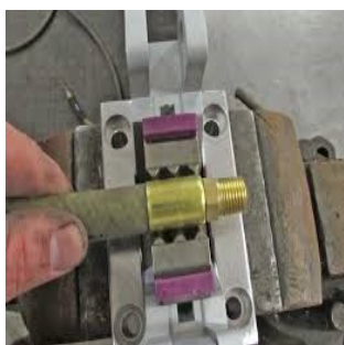
Mechanical cramped fitting

Review all airlines for suitability of use and type of fastener to secure the fitting. • Ensure the hoses used are made to British Standard for the application you are using. • Ensure the fitting is the correct size for the hose being used. • When adjusting any airline fitting, use a fresh, clean and undamaged part of the correct hose when fastening the fitting. • Use the appropriate fastener for your pressure applications. Seek advice from a hose specialist. • High pressure applications should use mechanical fabricated fitted or crimped fastenings. • The preferred mechanical fastenings shown below can be done in house with the correct equipment and training.