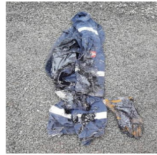
Bitumen covered PPE