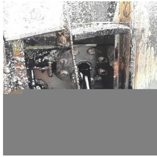
Butterfly Valve with Sensor Probe removed