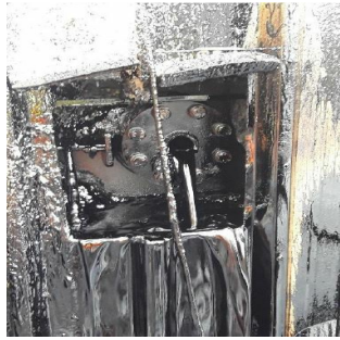
Butterfly Valve with Sensor Probe removed