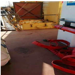
Site of hose recovery