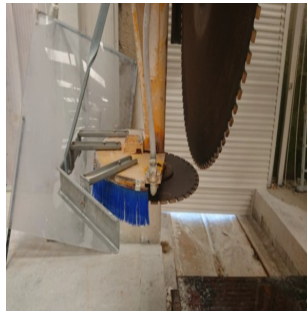
Image with new guard fitted

The reporting Dimension Stone Group member considers this a very rare occurrence, having used these machines for well over 20 years, this was the first instance of a tooth coming off the blade.