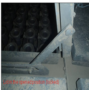
Lid in Locked Open Position

The lids have a sliding locking mechanism which prevents them from closing once this mechanism has locked into the lower runner position. The most likely cause of the incident is that the locking mechanism had not fully engaged, allowing the lid to drop on to the IP, when it was inadvertently knocked. As a result of the incident the contractor lost the ends of the two fingers down to the first knuckle.