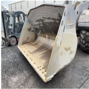
Before - Bucket showing razor sharp edge

Once the old cutting edge is removed, be aware that the base edge of a worn bucket can be very sharp NEVER run your hand or foot along the edge ALWAYS use a scraper or brush to clean the underside of the bucket, prior to fitting the new cutting edge.