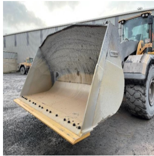
After - Bucket with new edge fitted