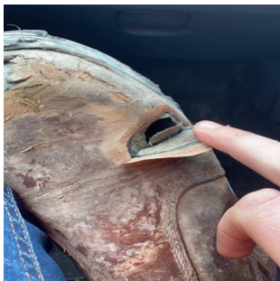
Damage to the boot above toe cap

A trained operative was changing a cutting edge on a loading shovel bucket. The old edge had been removed and the base edge cleaned with a scraper (as per safe operating practice). Before fitting the new edge, the operative noticed some dirt remaining on the base edge and raised his foot to rub it off. The base edge was worn sharp like a razor and sliced through his safety boot, above the steel toecap and sliced the operative's foot. The operative required a trip to A&E and the wound required stitching. This resulted in a LOST TIME INJURY (LTI) as the operative was required to rest his foot to ease pressure on the stitches.