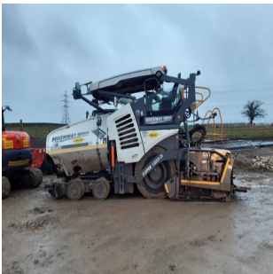
Paver with collapsed canopy