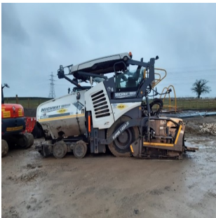
Paver with collapsed canopy