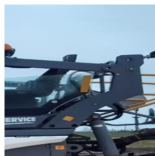
Bent ram and missing pin