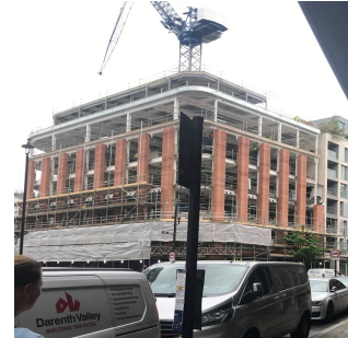
Operative is on 4th level