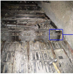
Fillet Being Cut