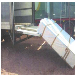
Electrical Cabinet 1

It was fortunate the injured person, who was standing near the rear of the vehicle, noticed the cabinet start to fall towards him and began to move out of the way; otherwise his injuries could have been even more severe.