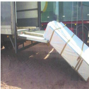
Electrical Cabinet 1

It was fortunate the injured person, who was standing near the rear of the vehicle, noticed the cabinet start to fall towards him and began to move out of the way; otherwise his injuries could have been even more severe.