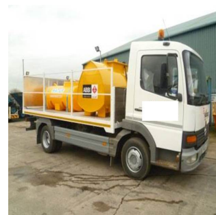
Rails no greater than 470mm apart