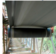
Image of roller before