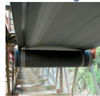
Image of roller before