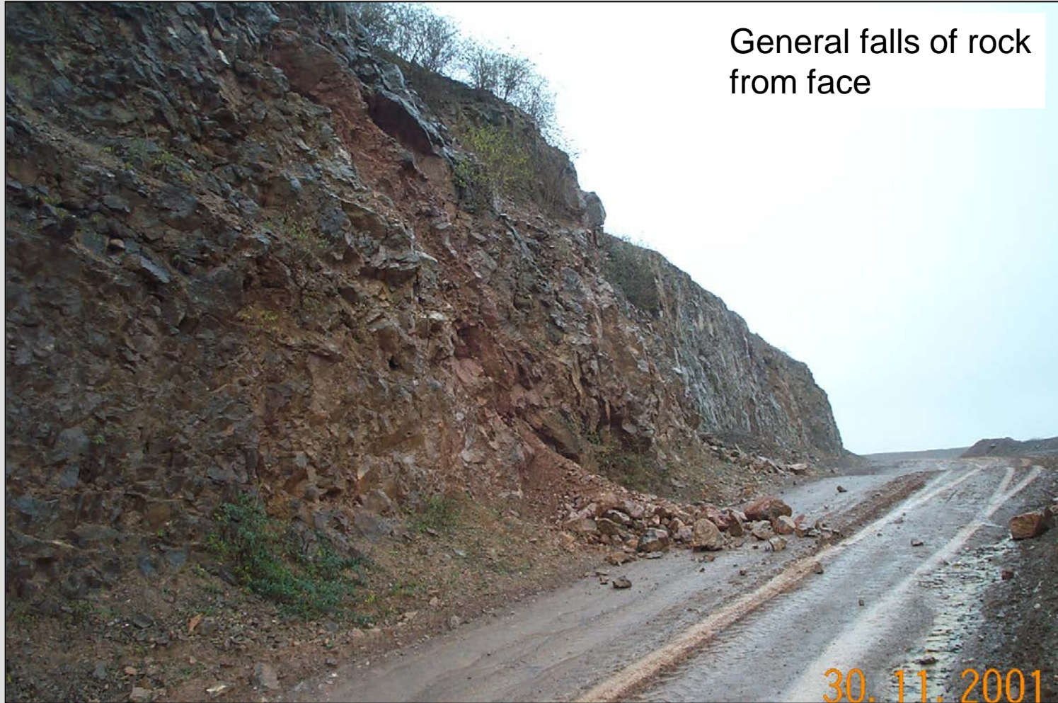
General falls of rock from face