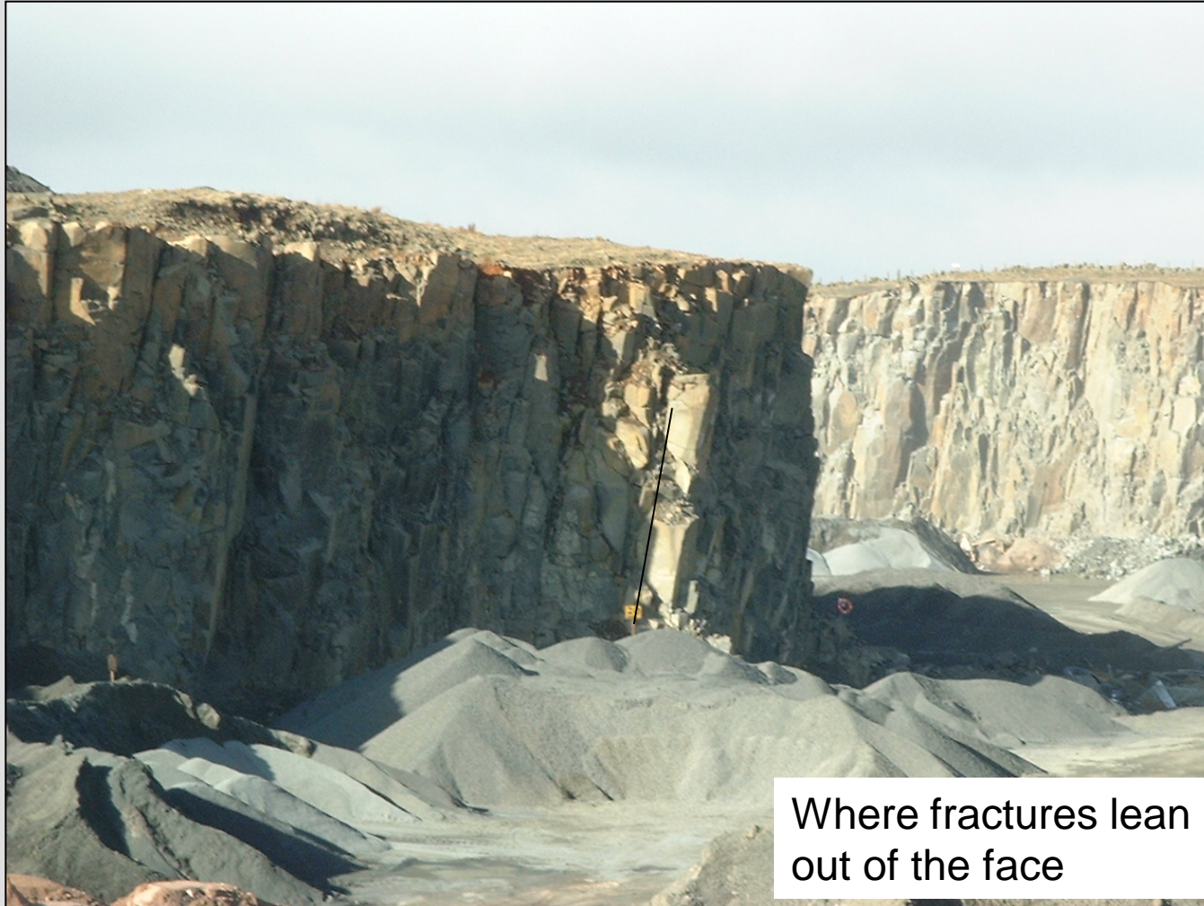
Where fractures lean out of the face