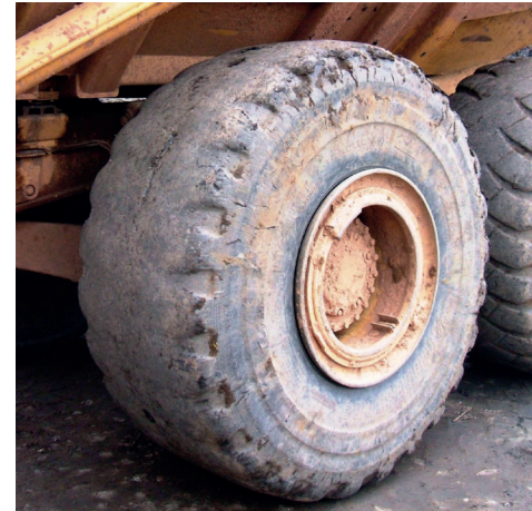
Tyre is worn and damaged and must be replaced immediately.

On all quarry vehicles tyre maintenance is critical and tyres should be checked daily by the driver for both wear and damage. If the tread on the tyre is sufficiently worn or damage is detected then the tyre must be replaced.